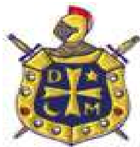
1920's DeMolay Emblem